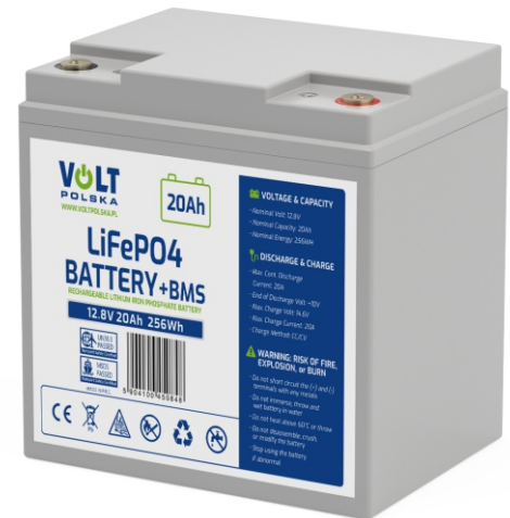
LifePO4 battery 12,8V 20Ah