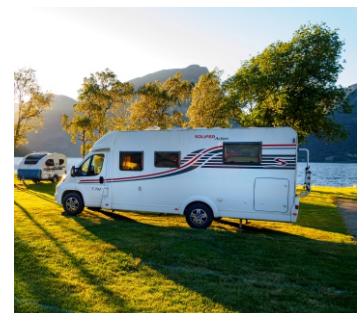
Use in motorhome