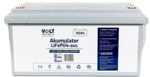
LifePO4 battery 12,8V 150Ah (100A)

* Boat installations (ONLY using a hermetic case for the battery)!