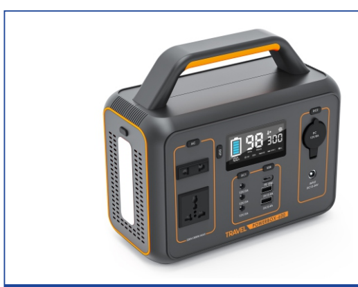
TRAVEL POWERBOX OPTI 600