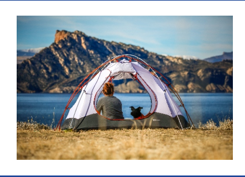
TRAVEL POWERBOX OPTI 600