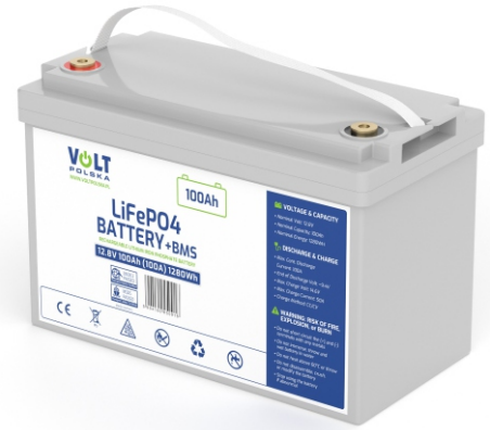
LifePO4 battery 12,8V 100Ah (100A)

* Boat installations (ONLY using a hermetic case for the battery)!