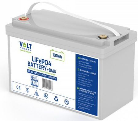
LifePO4 battery 12,8V 100Ah (150A)

* Boat installations (ONLY using a hermetic case for the battery)!