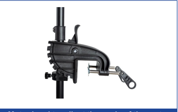
Motor head to adjust the angle of the motor